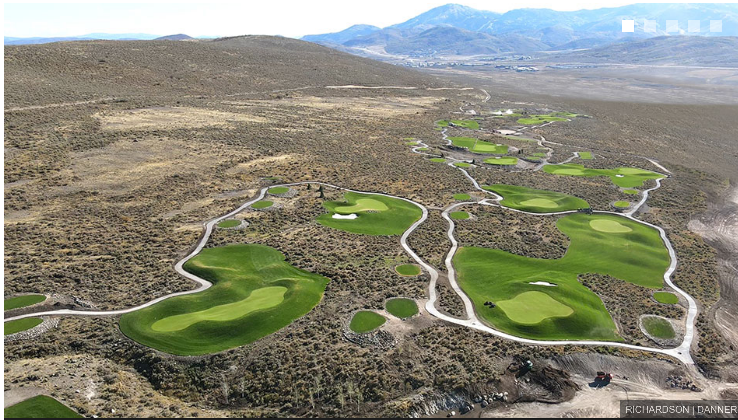
A new 18-hole par-three course will open at Promontory Club in summer 2023