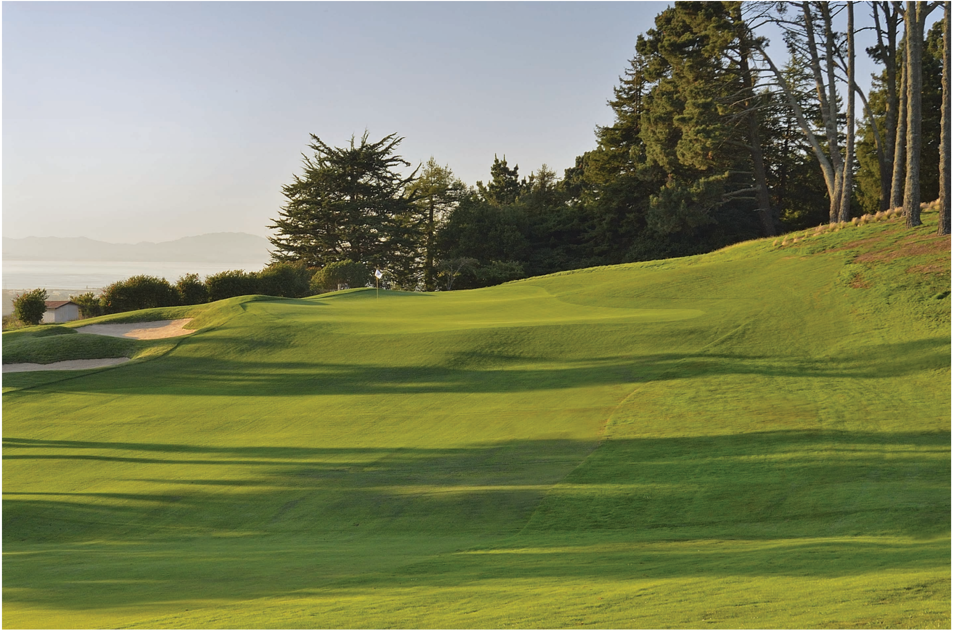
HOLE NO. 13