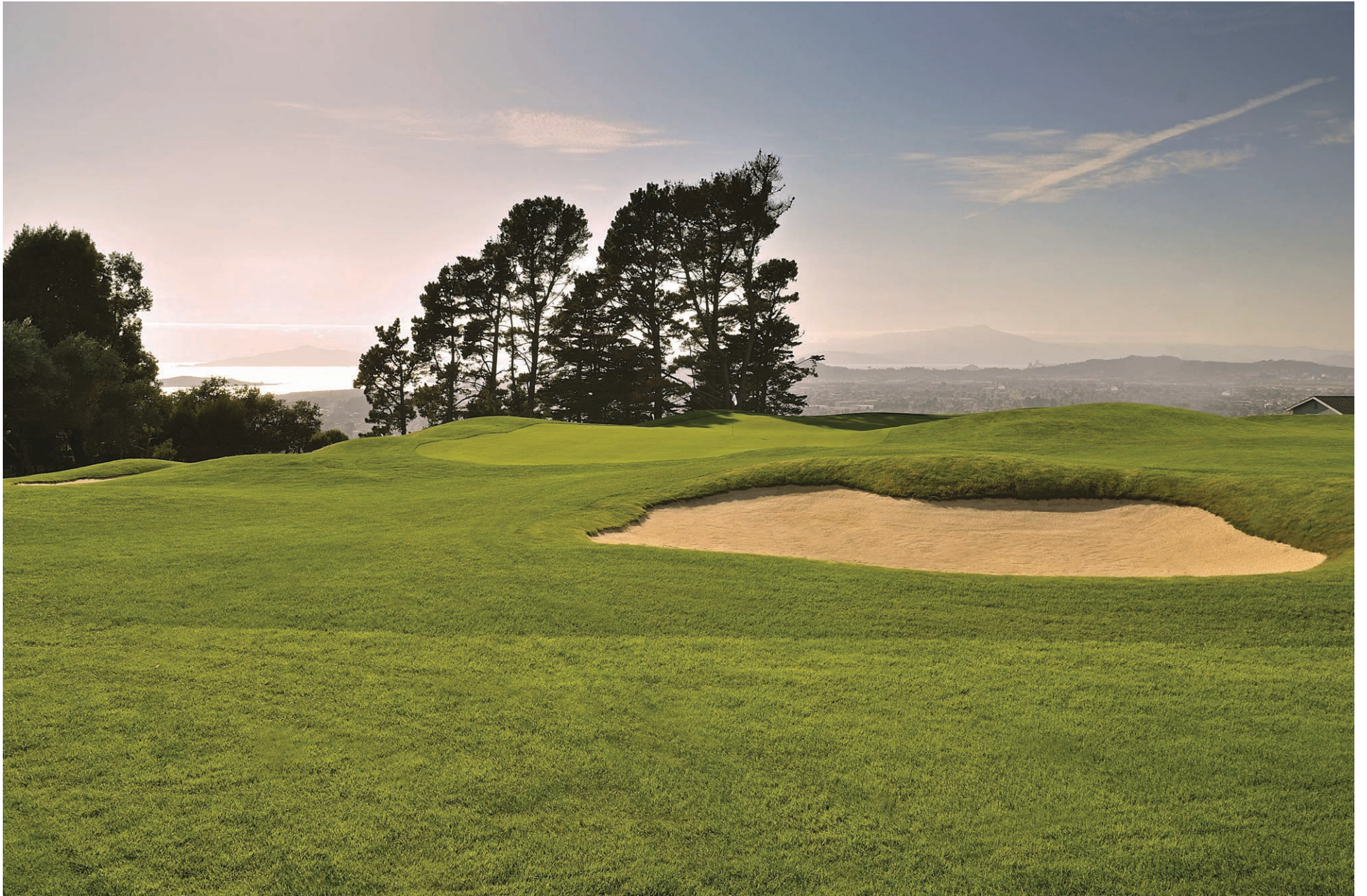
HOLE NO. 8