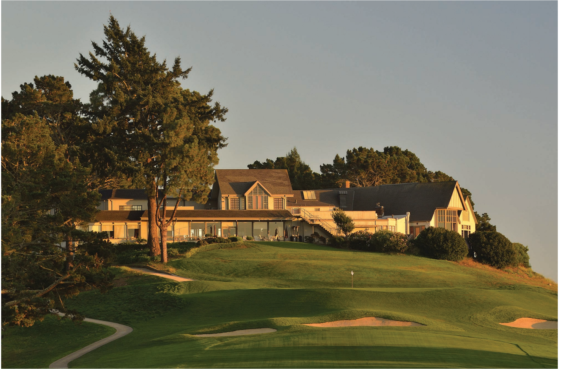
HOLE NO. 18