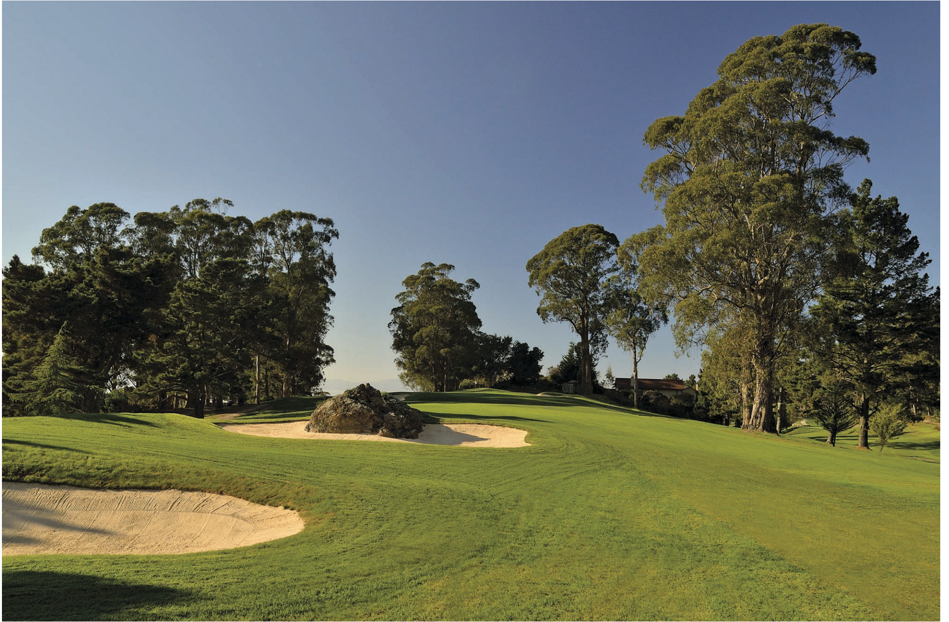
HOLE NO. 5