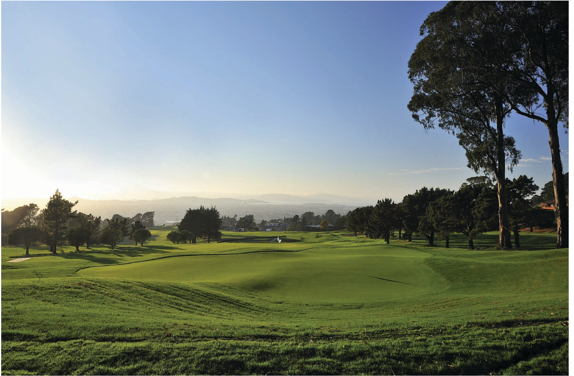
HOLE NO. 7