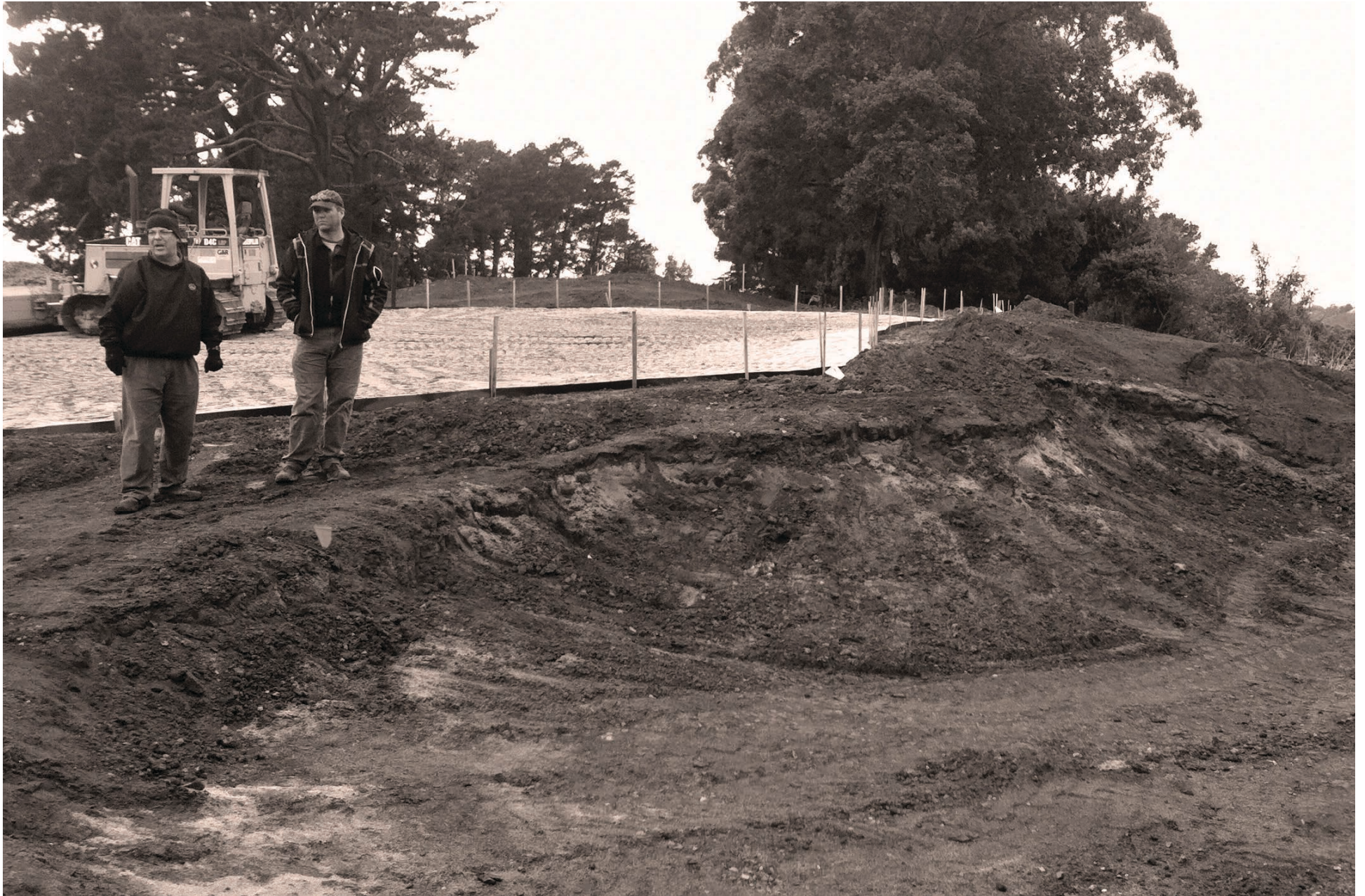
HOLE NO. 16 — FORREST RICHARDSON & SHAPER, KYE GOALBY