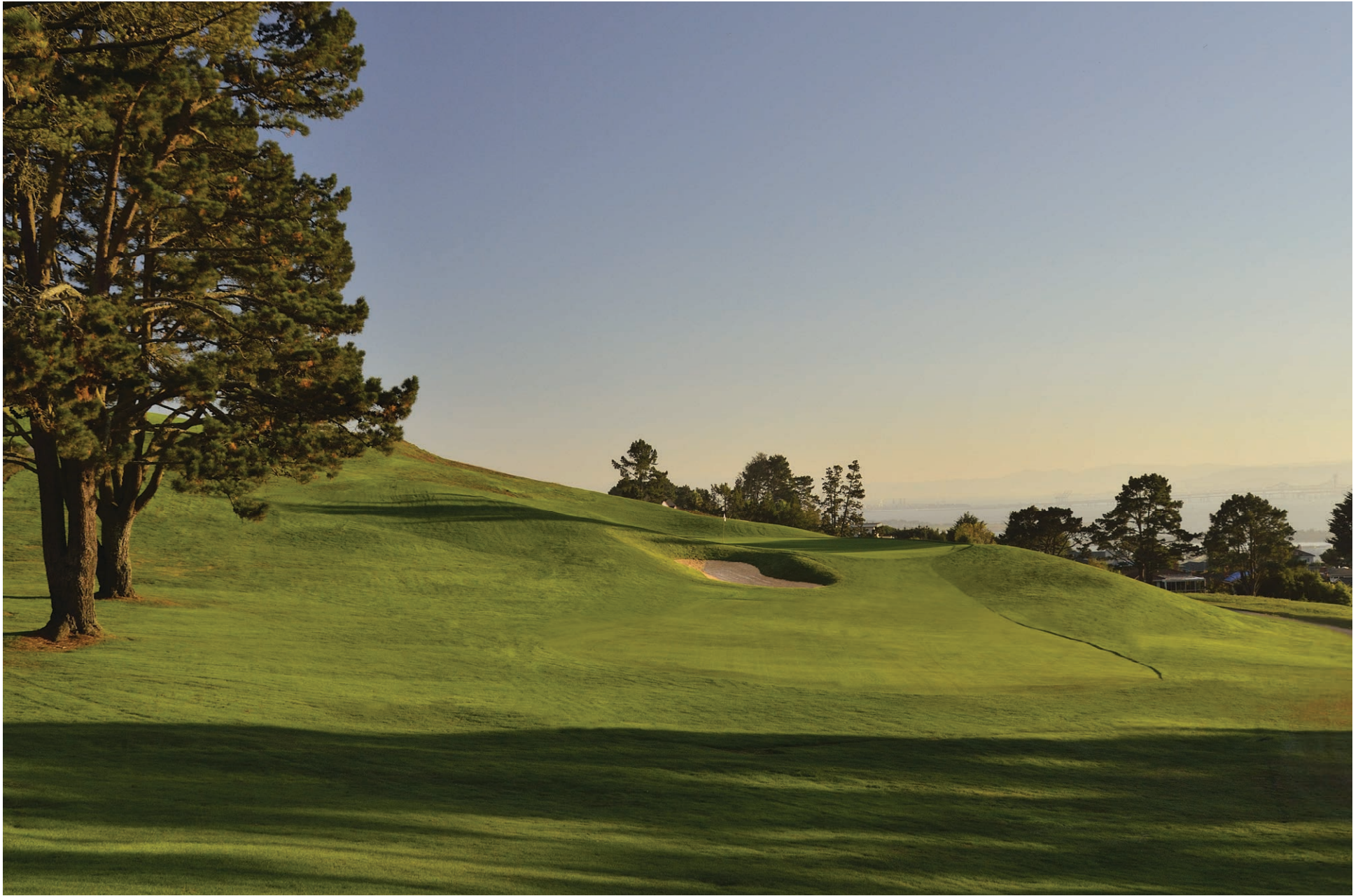
HOLE NO. 12