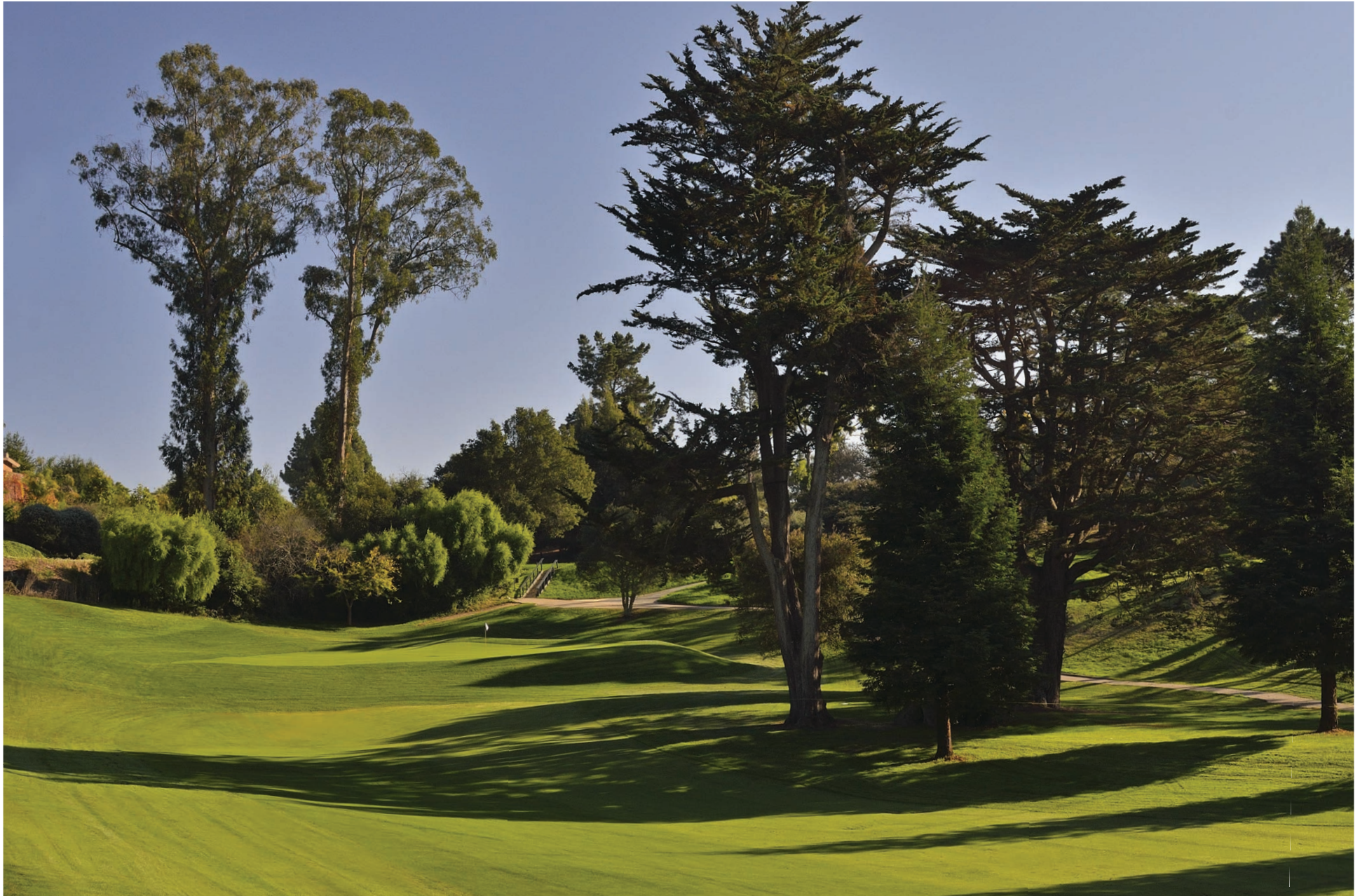
HOLE NO. 4