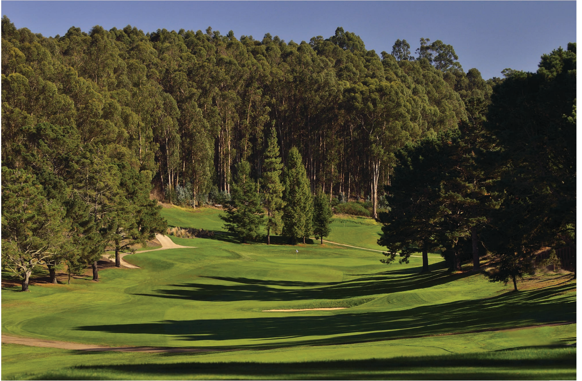
HOLE NO. 1