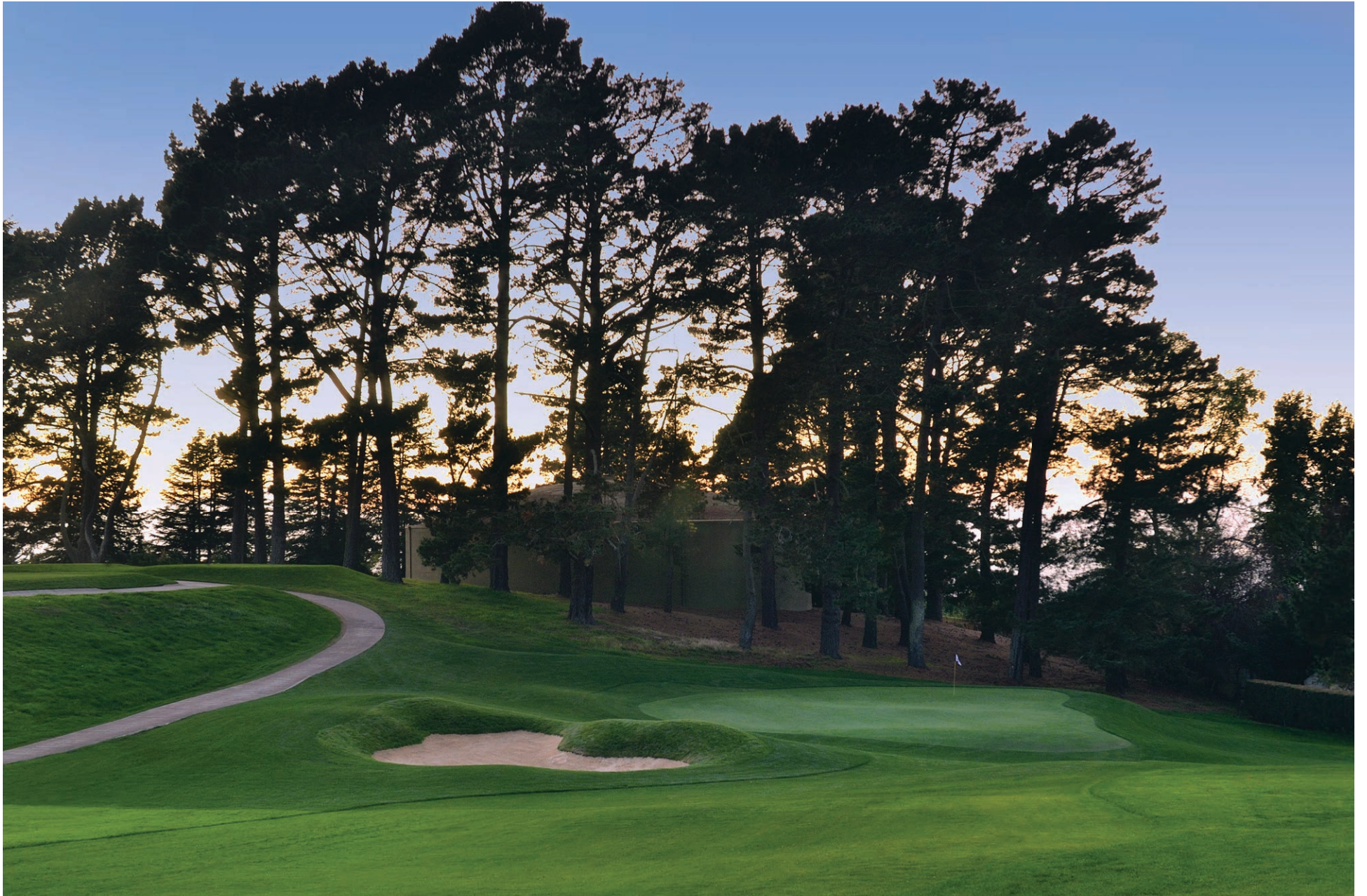
HOLE NO. 17