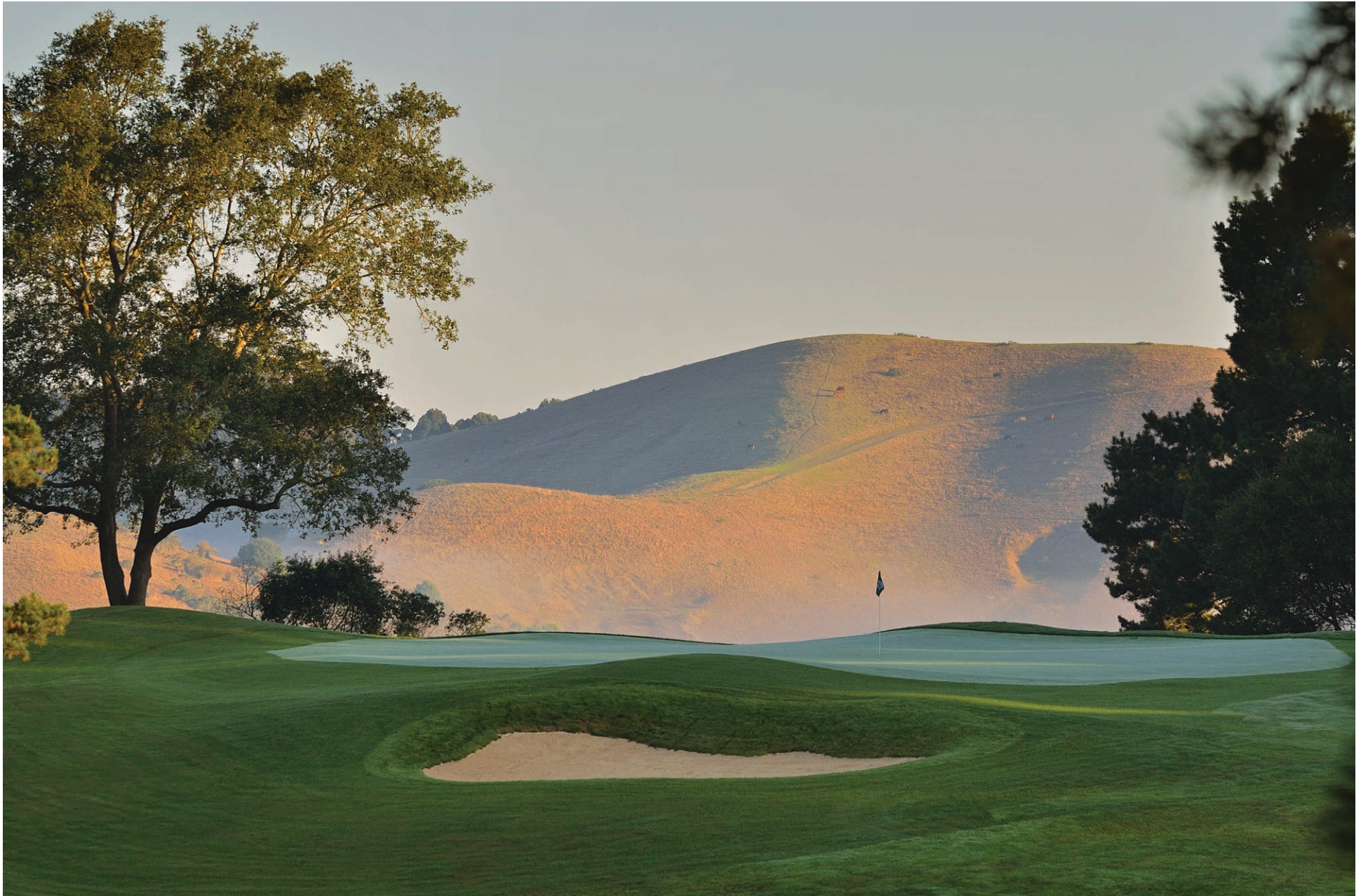
HOLE NO. 15