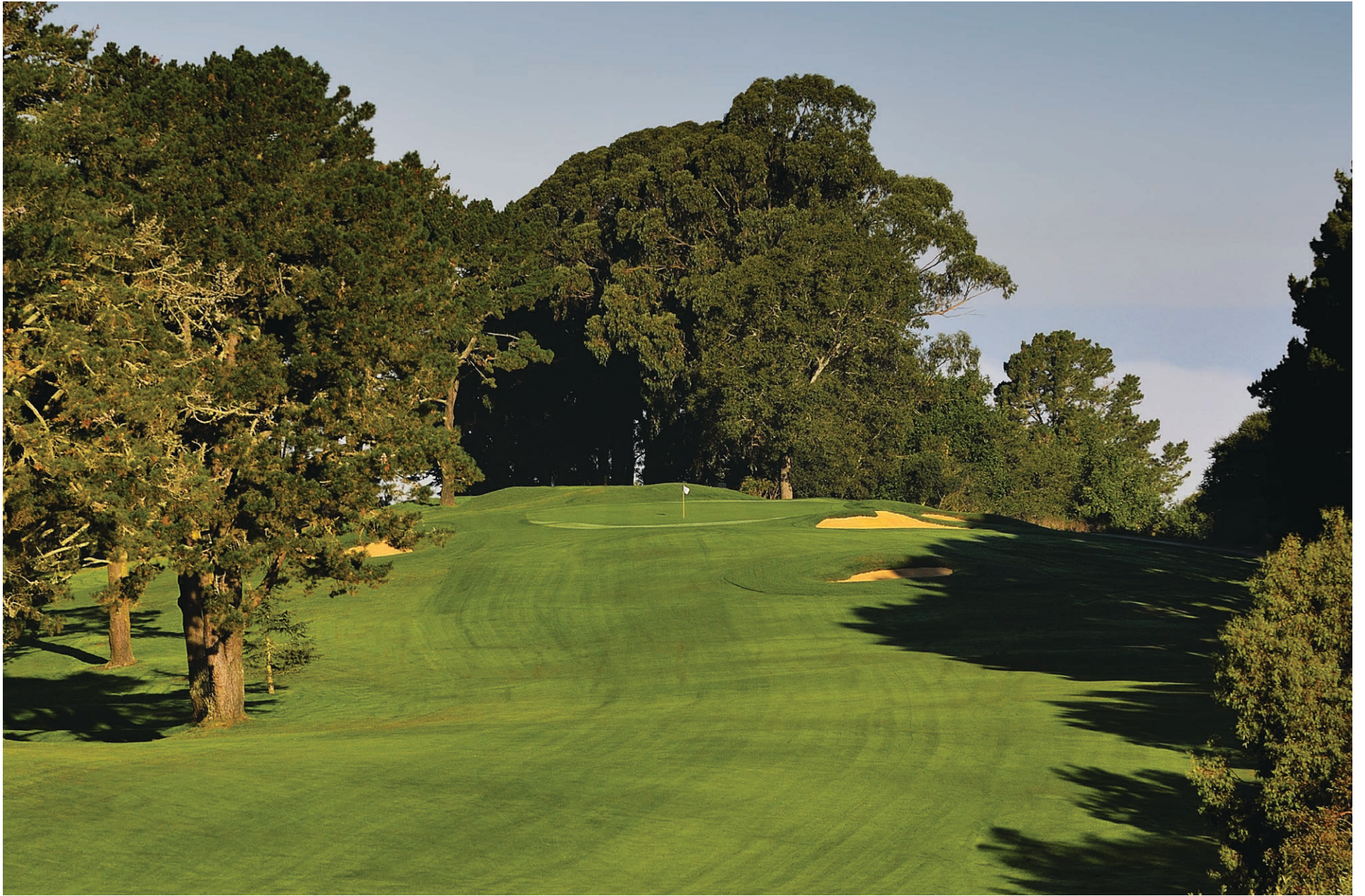
HOLE NO. 16