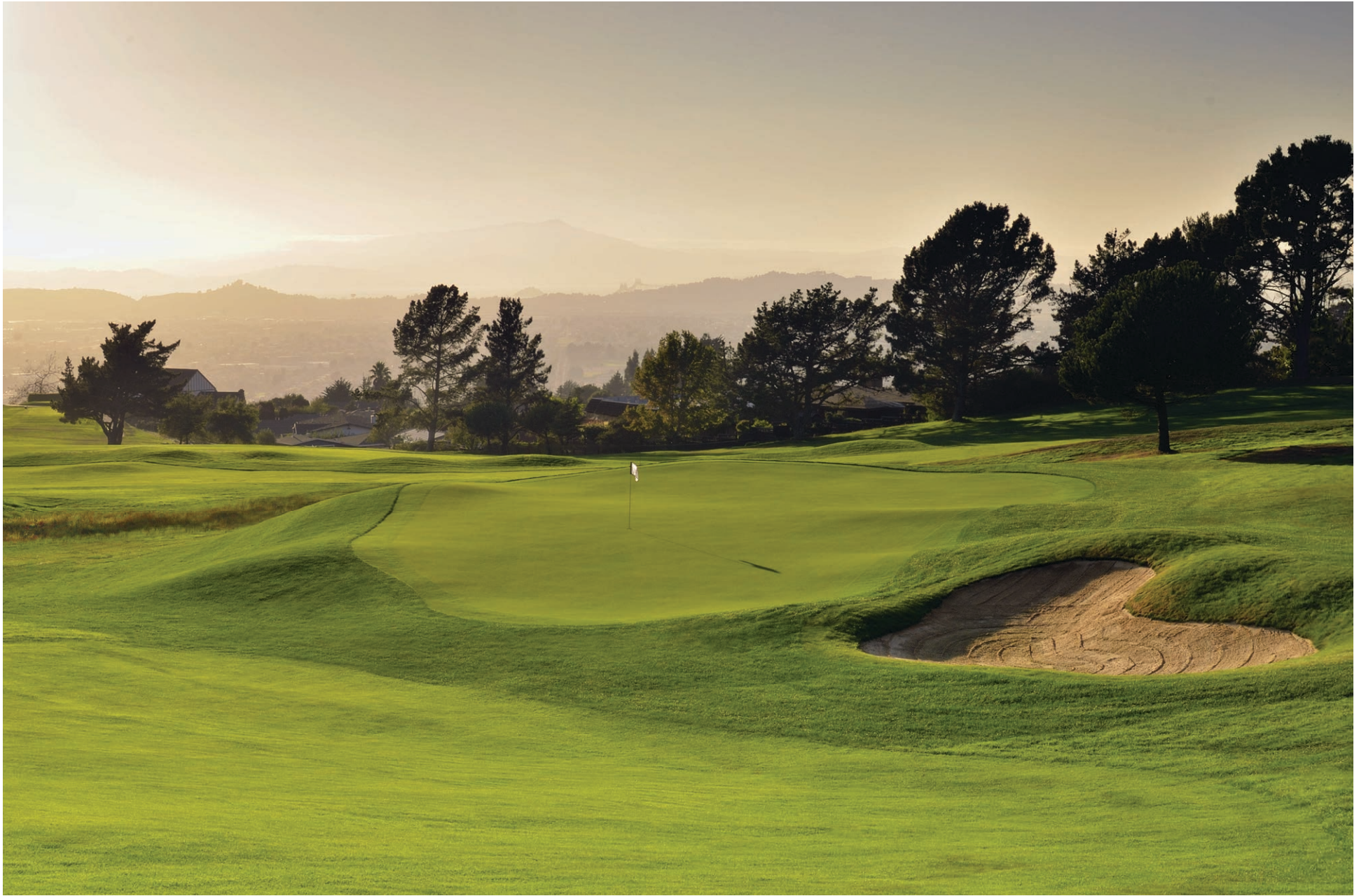
HOLE NO. 6