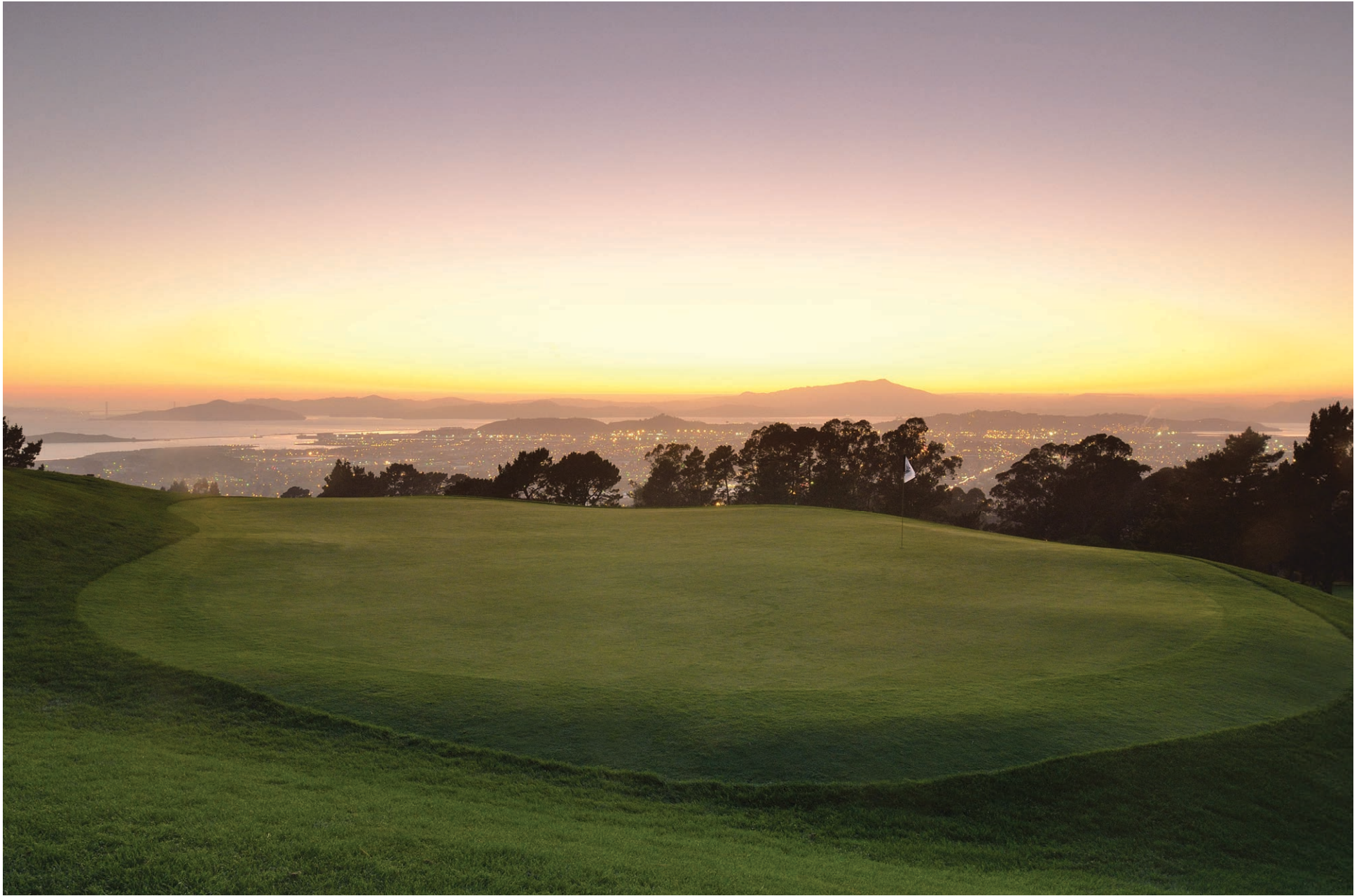
HOLE NO. 18